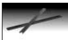
Seat Rail Bushing Kit