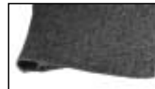
Sisel Spring Cover